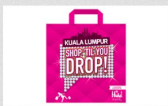
KL Shop 'Til You Drop! »