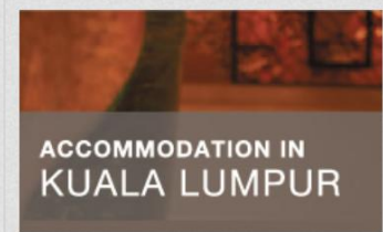
Accommodation In Kuala Lumpur »