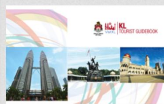
KL Tourist Guidebook »