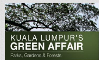
Kuala Lumpur's Green Affair: Parks, Gardens & Forests »