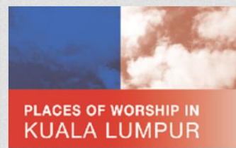
Places Of Worship In Kuala Lumpur »