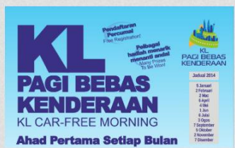
KL Car Free Morning »