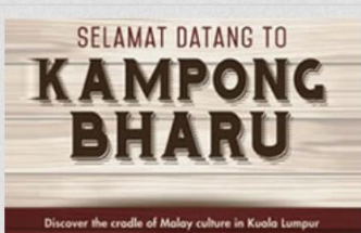
Jalan-Jalan@Kampong Bharu »