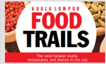
KL Food Trails »