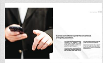
MICE Booklet »