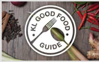
KL Good Food Guide »

Visit http://www.visitkl.gov.my/visitklv2/index.php?r=column/csix&id=142 for e-brochure for details of our great Kuala Lumpur.