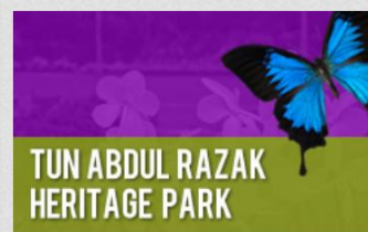
Tun Abdul Razak Heritage Park »