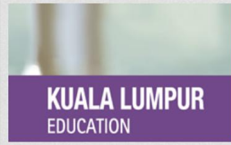
Kuala Lumpur Education »