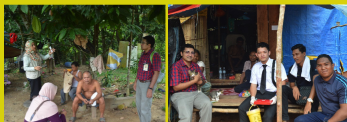
WHO-KKM-JKNP Community Leader Empowerment Project (4/9/18-29/3/19)

The Dermatology Department, in conjunction with the State Health Department (JKN Pahang) and the World Health Organization (WHO), successfully completed a six-month